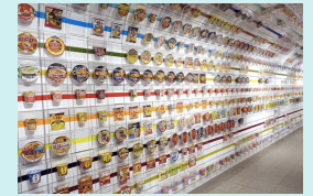
Cup Noodle Museum