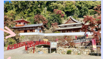
Minooyama Ryuan Temple