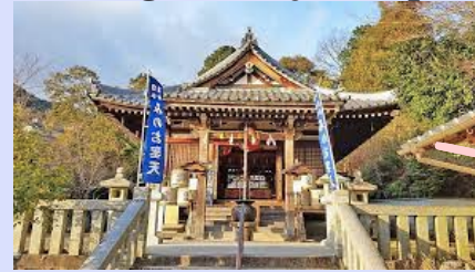
Shotengu Saikoji Temple