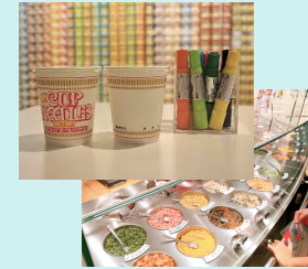
My Cup Noodle